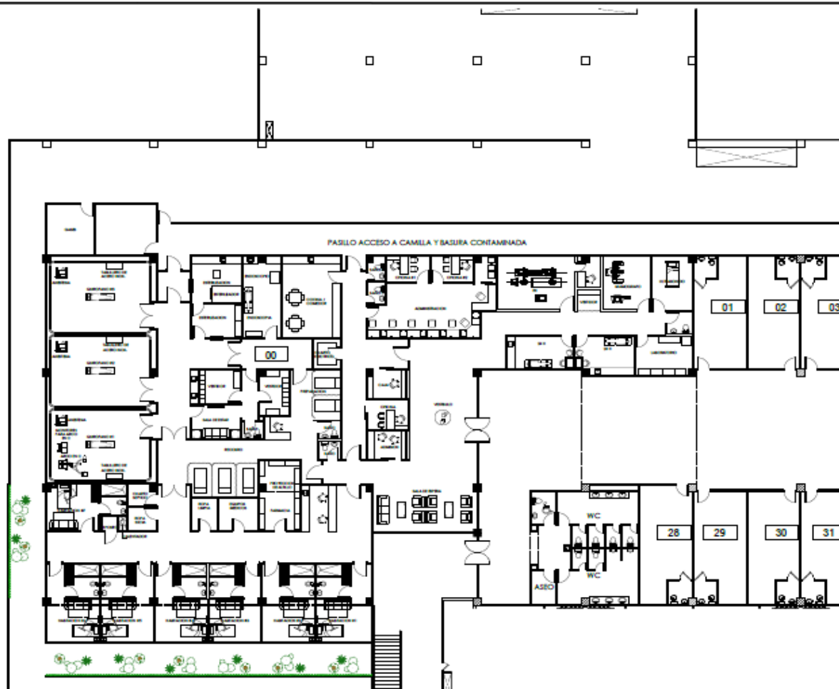
PLANTA ARQUITECTONICA NIVEL - 200 CLINICA HOSPITAL / SIGNATURE PLAZA OPCION - 150408